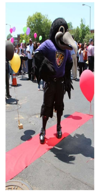
Poe, the official Mascot of the Baltimore Ravens walked the red carpet during Employee Appreciation Day on May 9, 2018.

Phase I focused on creating a special event to recognize all employees. On May 9, 2018, the Department celebrated the "State Employee Appreciation Day" by hosting a special celebration during the lunch to show appreciation for the Maryland Department of Labor staff. The event was coordinated by the Director of Constituent Services along with the Office of the Secretary staff and featured a 1980's theme to represent the agency's customer service rating ranking consistently in the 80% range. The staff was delighted to attend dressed in their best 1980's attire including the big hair, neon colors and large shoulder pads reminiscent of the