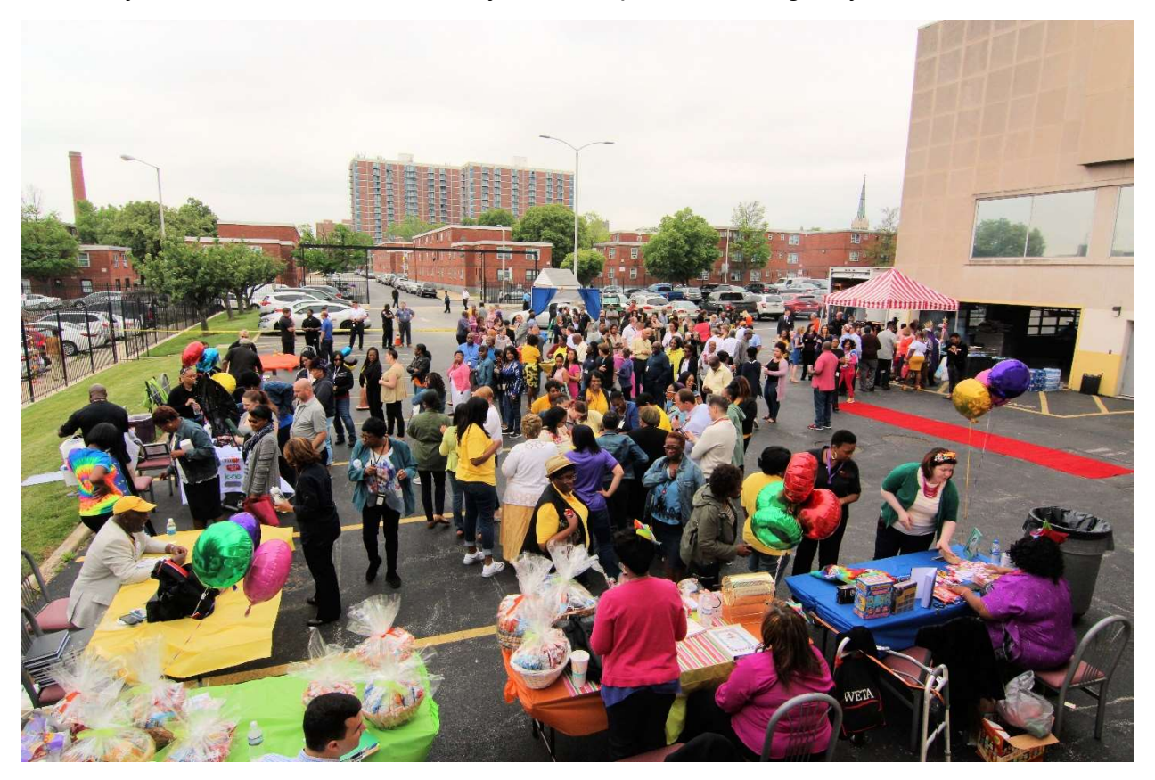
Employees played games and were served lunch by the agency's leadership team.

On May 8, 2019, the Maryland Department of Labor staff celebrated the "State Employee Appreciation Day" by hosting a special celebration during lunch. The event was coordinated by the director of constituent services along with the office of the secretary staff. The theme was Candyland to represent the agency's "can-do" attitude.